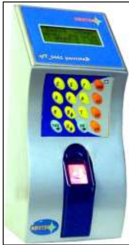
Finger Print Readers

Bio-Matric / Finger Print & Face Readers